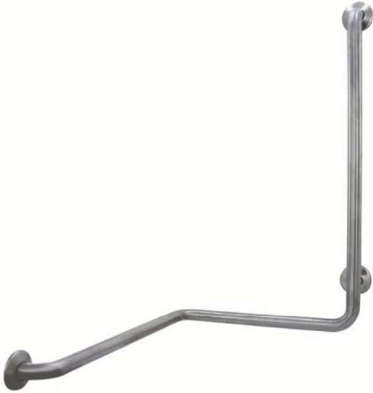
The picture belongs to NOFER 15050.S