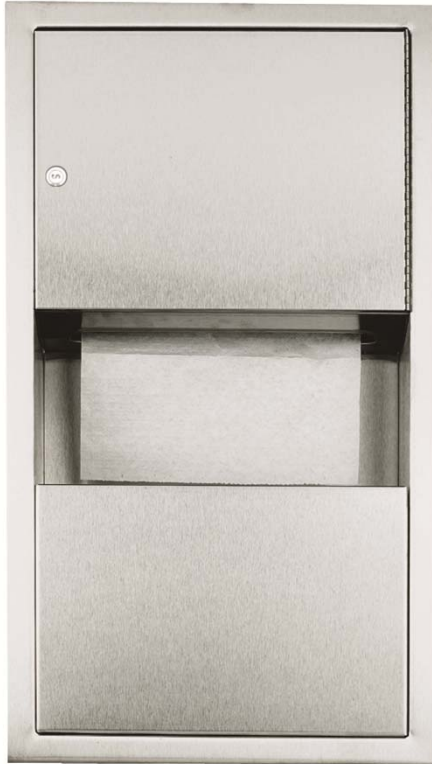
The picture belongs to the built-in model