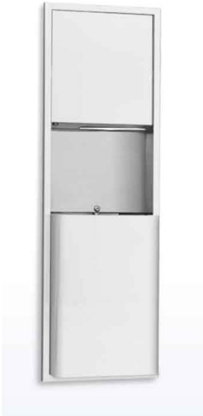
The picture belongs to the built-in model